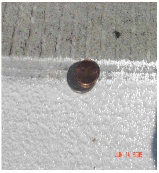
The coins represent the depth of the groove